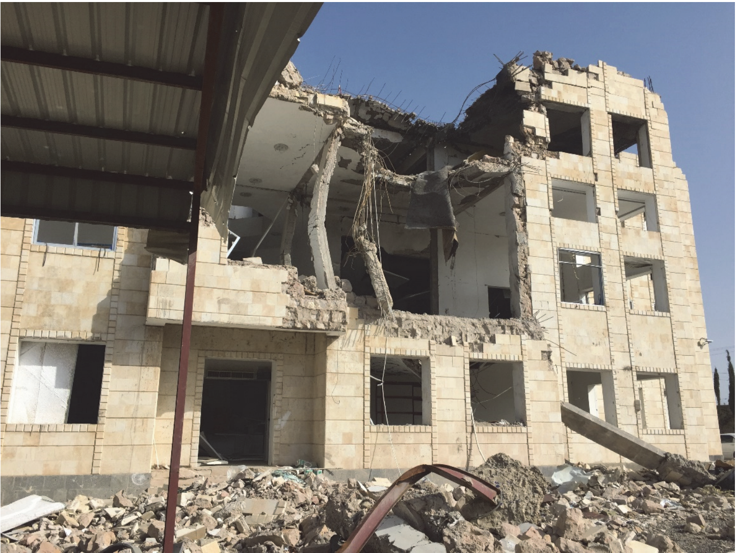
Several offices and a laboratory were destroyed when coalition bombs hit the Bio Pharma factory, which manufactures pharmaceutical products.

air. “[The bomb] hit the administrative building, where the laboratory and storehouse are,” al-Aush told Human Rights Watch. “I was disoriented and ran from my room.”