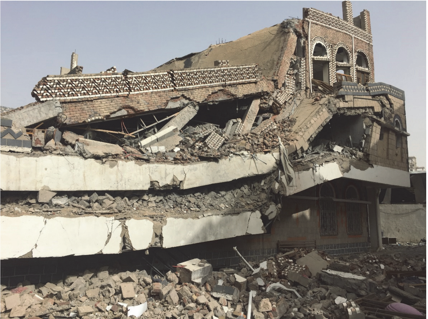
A coalition airstrike destroyed the Sanaa Chamber of Commerce offices in a January 5, 2016 airstrike.

A neighborhood resident told Human Rights Watch that the strike targeted a meeting of Houthi commanders that took place that evening at the Chamber of Commerce building. He said that one commander died in the attack. Human Rights Watch could not confirm his account with additional sources.