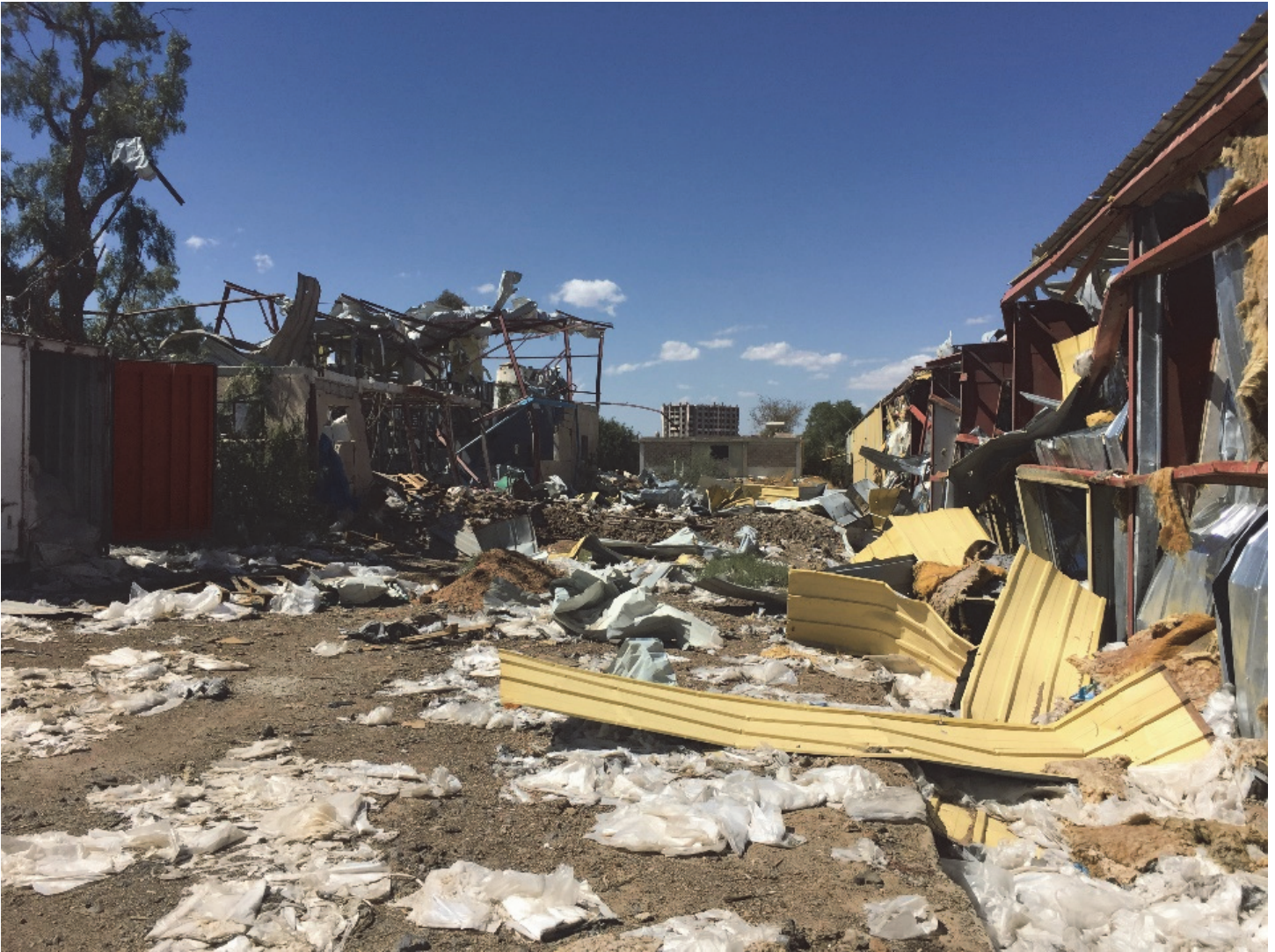
The al-Aqil Industrial compound, hit by three coalition airstrikes since the beginning of the war, housed seven factories that produced consumer goods including plastic bags, batteries, food, and clothing.

[After it hit,] I didn't notice what happened. I saw the dust and stones, then they took me to the hospital directly. 74