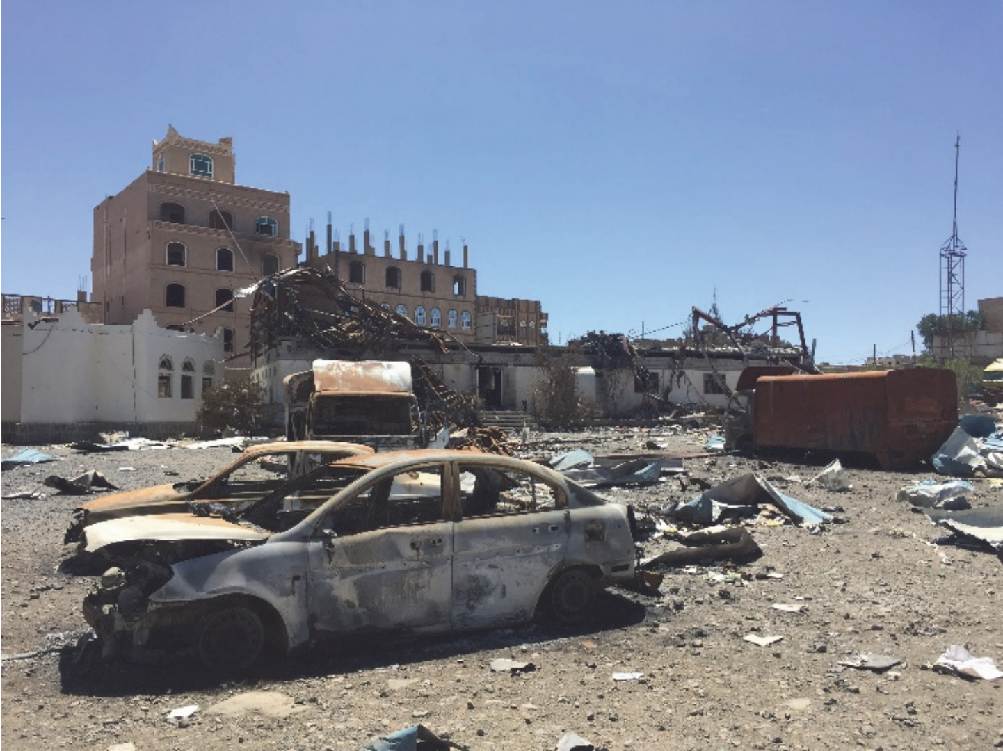
Six coalition bombs hit the al-Shihab Industrial Compound, housing food and pharmaceutical products, on January 29 and 30, 2016, killing one and wounding three civilians.

American and Israeli goods, which included Houthi logos and links to Houthi-affiliated media sources, as well as the commercial logos of Nestle and other companies. 77 The Shihab company imports Nestle products. The page had not been active for several months before the war began.