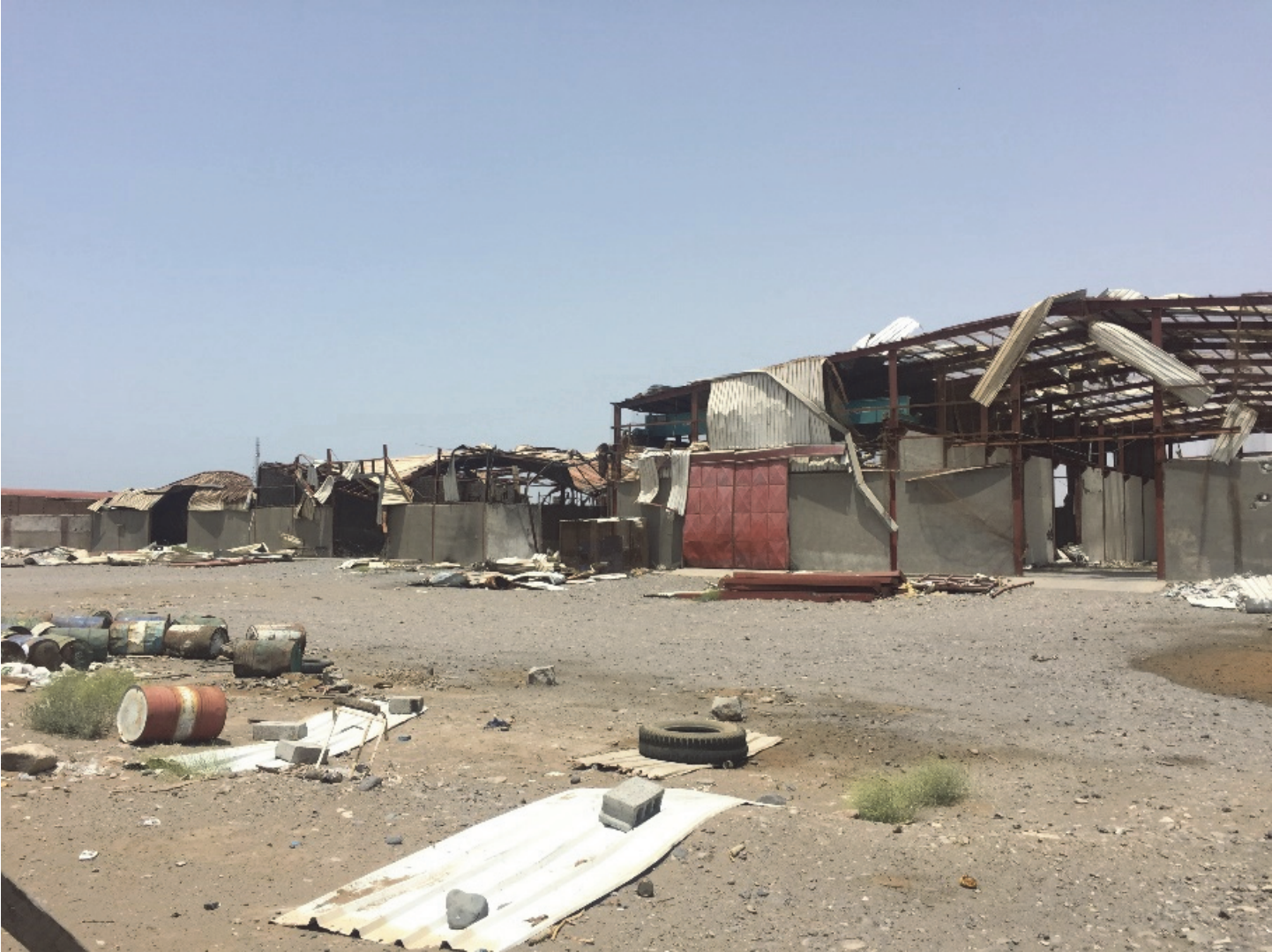
Coalition bombs struck two of these five storage hangars in Hodaida on January 6, 2016. The hangars stored school furniture, car parts, dry and canned food. Two of them contained production workshops for zinc sheeting and metal fencing grates.

Muhammed Aswad, 60, a guard at the facility, said, “I heard a bang with the first strike, and then [I heard] planes flying before the second one. One of the cars in the yard burst into flames.” 69 Aswad told Human Rights Watch that four other men were in the yard at the time of the attack. They paid rent to use the yard to sell black-market diesel to passing cars and vans, he said. The men fled after the first strike.