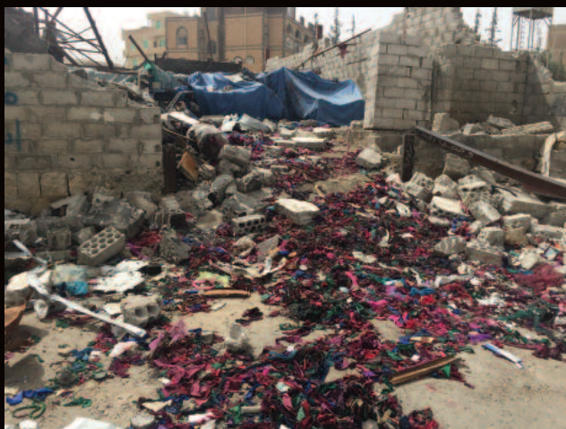
The Middle East Workshop for Sewing and Embroidery in Sanaa, Yemen, after coalition aircraft bombed it on February 14, 2016. Of the 17 workers inside at the time, one died and three sustained injuries.

Human Rights Watch also calls on foreign governments to halt sales and transfers of all weapons and materiel to parties to the conflict in Yemen if there is a substantial risk of these arms being used to commit or facilitate serious violations of the laws of war.