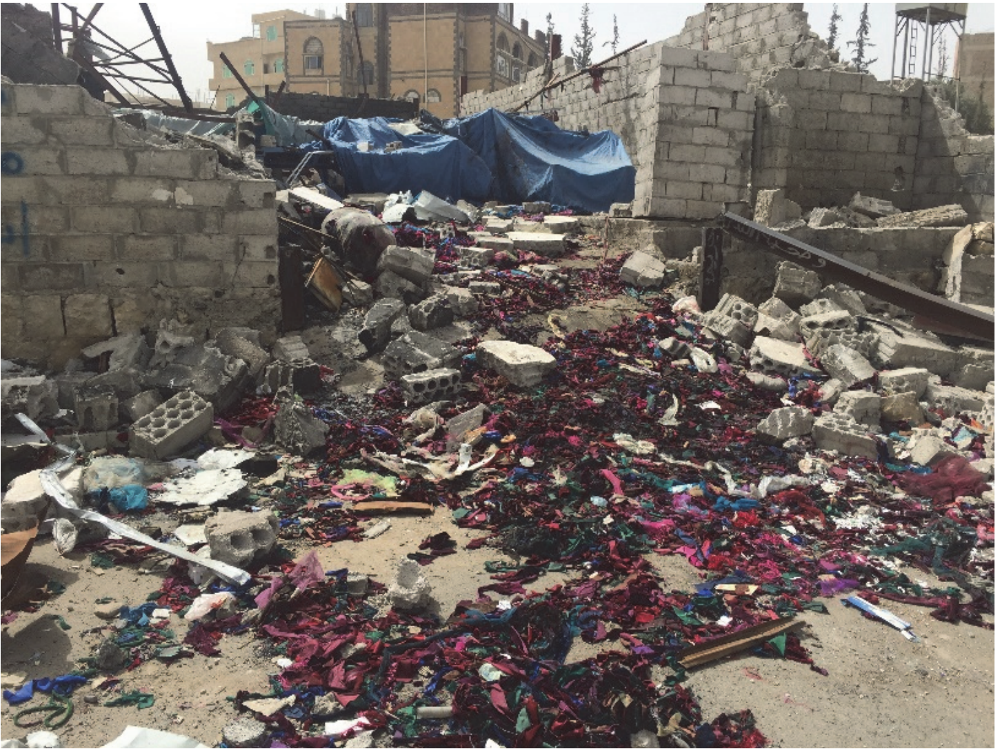
Seventeen workers remained inside the Middle East Workshop for Sewing and Embroidery when coalition aircraft bombed it on February 14, 2016. One died and four sustained injuries.

Raouf Mohammed al-Sayideh, 25, an embroidery worker at the factory who lives nearby, said: