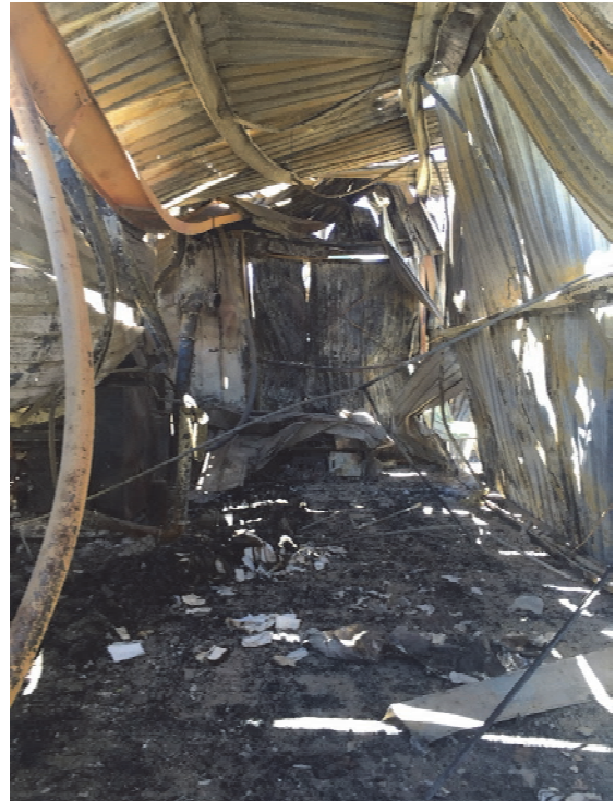
One of the production hangers in the al-Shihab Industrial Compound destroyed in coalition airstrikes on January 29 and 30, 2016.

Human Rights Watch examined the site on March 21, 2016 and found no evidence the factory had been used for military purposes. The airstrikes had completely destroyed the hangers by collapsing the structures and ripping off the zinc roofing of the attack on the Nido milk powder hangar left a deep crater in the floor. All heavy steel machinery was destroyed, as well as all of the finished products that were being stored. The remains of at least eight damaged or destroyed vehicles remained in the yard.