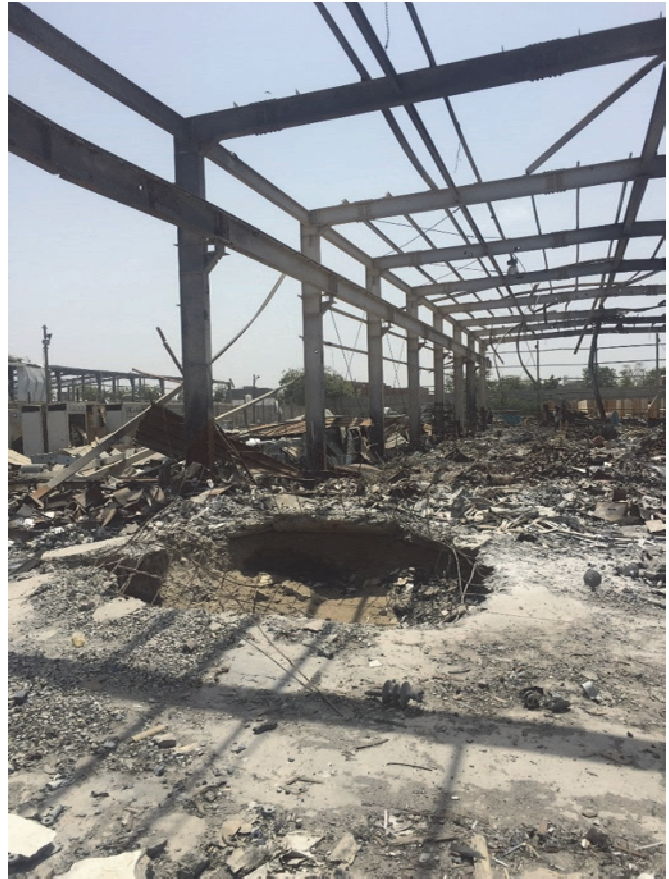
A coalition airstrike hit a hangar at the Electrical Company Administration of Hodaida, leaving this crater in the floor.

Human Rights Watch examined the site on March 29, 2016. Researchers found one crater in the concrete floor about three meters wide. A large broken metal roof beam hung down to the floor where employees said the third bomb hit. Researchers could not access the second locked, but reportedly empty, storage hanger where they said the second bomb hit, as employees said it belonged to a different government authority. Employees told Human Rights Watch that no military supplies were stored in the hangar targeted, and that no military targets or Houthi installations were located nearby. One employee told Human Rights Watch that a house where about 10 Houthi fighters slept at night was located on the residential street behind the Electricity Administration compound, about 100 meters from the site.