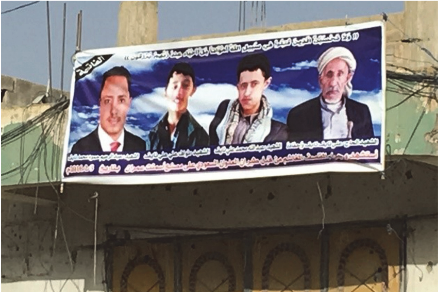
A sign commemorating four members of the Naif family killed when coalition forces bombed the factory entrance on February 3, 2016.

factory workers told Human Rights Watch researchers that they also saw three more BLU-108 canisters with their “skeet” or submunitions still attached lying on the quarry tracks along with a parachute. The workers subsequently provided Human Rights Watch with photos that they took of the remnants lying in place where they landed, that showed the unexploded submunitions.