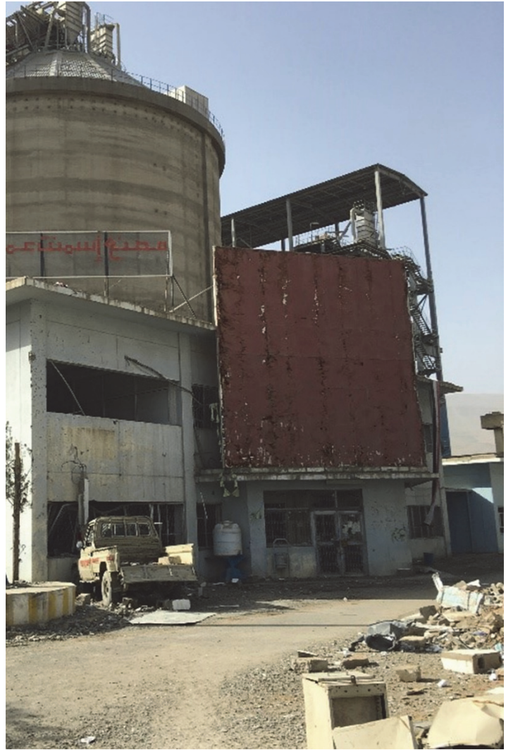
Entrance to the Amran Cement Factory, a government-owned factory that coalition forces struck once in June 2015, and twice in February 2016.

At about 5 p.m. the same day, coalition aircraft dropped cluster munitions on al-Raha mountain, including into the factory's quarry and next to the cement crusher. The next morning, cement factory workers Kamal Hussein Qaid, 50, and Bandar Ahmed Daoud, 33, headed up to inspect damage at the cement factory's quarry, about one kilometer from the main factory building and connected to al-Jumaima Mountain. On the way to the quarry they found and collected remnants of munitions that were lying in the middle of the road. 84