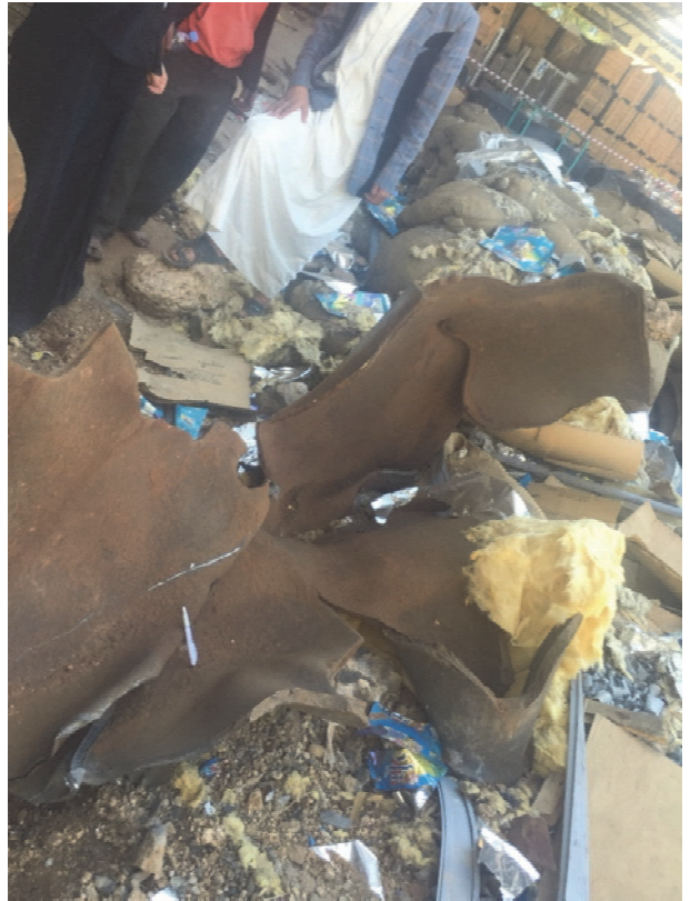
Remnant of an MK-84 GP (General Purpose) bomb at the al-Aqil Industrial Compound.

Human Rights Watch established that al-Aqil industrial compound is located about 100 meters from the Maintenance Corps Camp, a military site for the maintenance of military vehicles and weapons. The walls of the two sites are adjacent. However, factory workers said they did not know whether it remained in use or not. Ghabish told Human Rights Watch that coalition aircraft had struck the camp at least 13 times since the beginning of the war.