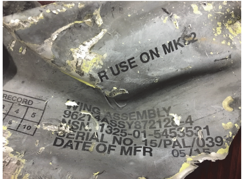
Remnant of a Paveway IV guided bomb that struck the Hodaida warehouses. The national stock number on the wing assembly indicates that Raytheon in the United Kingdom manufactured the bomb in May 2015, after the start of the war.