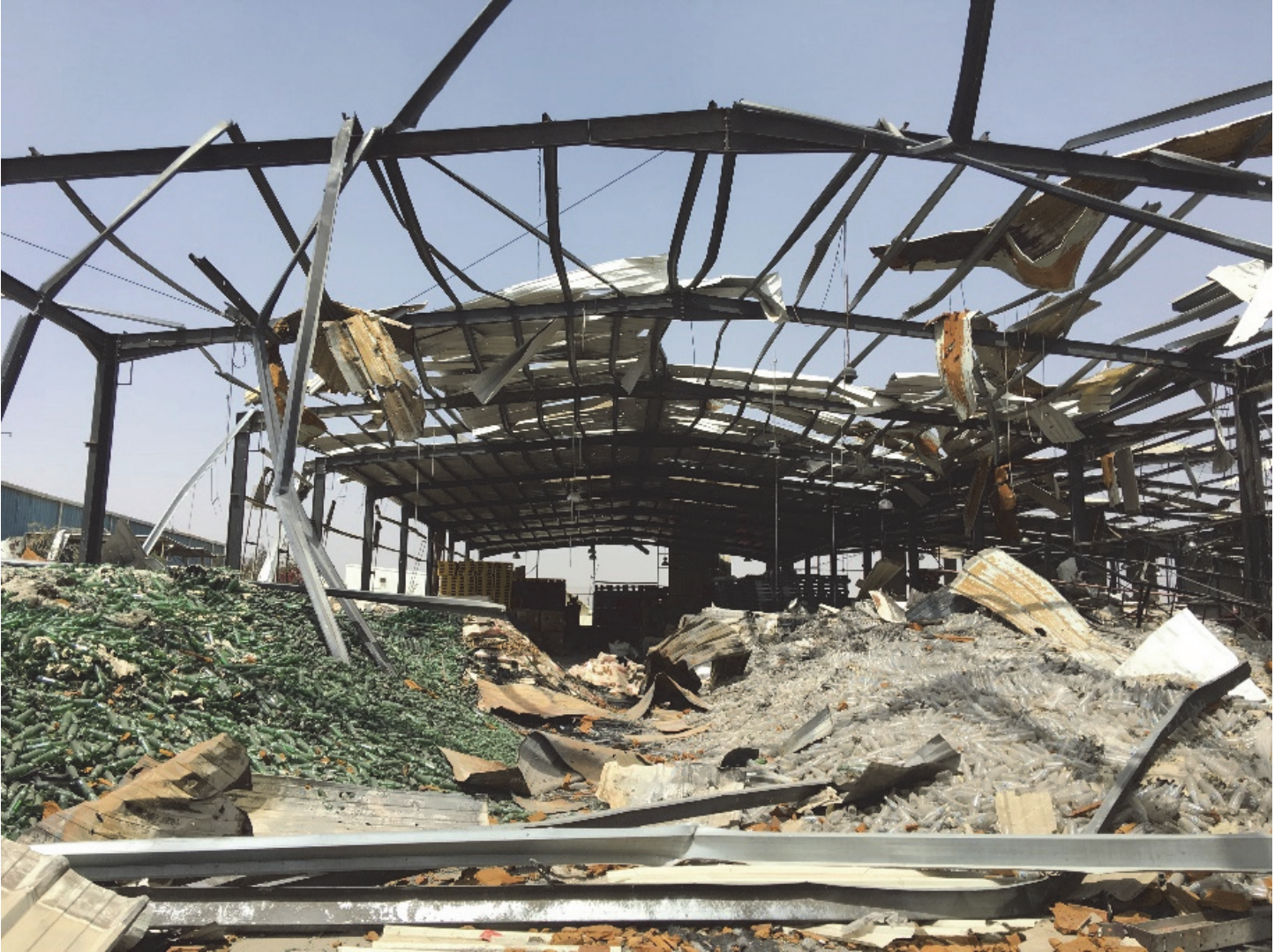
One of the bombs destroyed the factory's glass and plastic bottling production lines.

hit, I was already in the street. The second and third bombs landed inside the factory hanger.